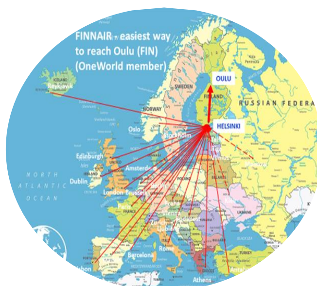
Picture 2. Easiest way to reach Oulu is via Helsinki airport from all member countries.

Oulu region may be reached quite easily also via Sweden. The city of Luleå has its own airport from which it is 270 km drive to Oulu region. Furthermore, all the road network of Norway and Sweden can be utilized to entry to Finland. The border control is located between the cities of Haparanda (SWE) and Tornio (FIN).