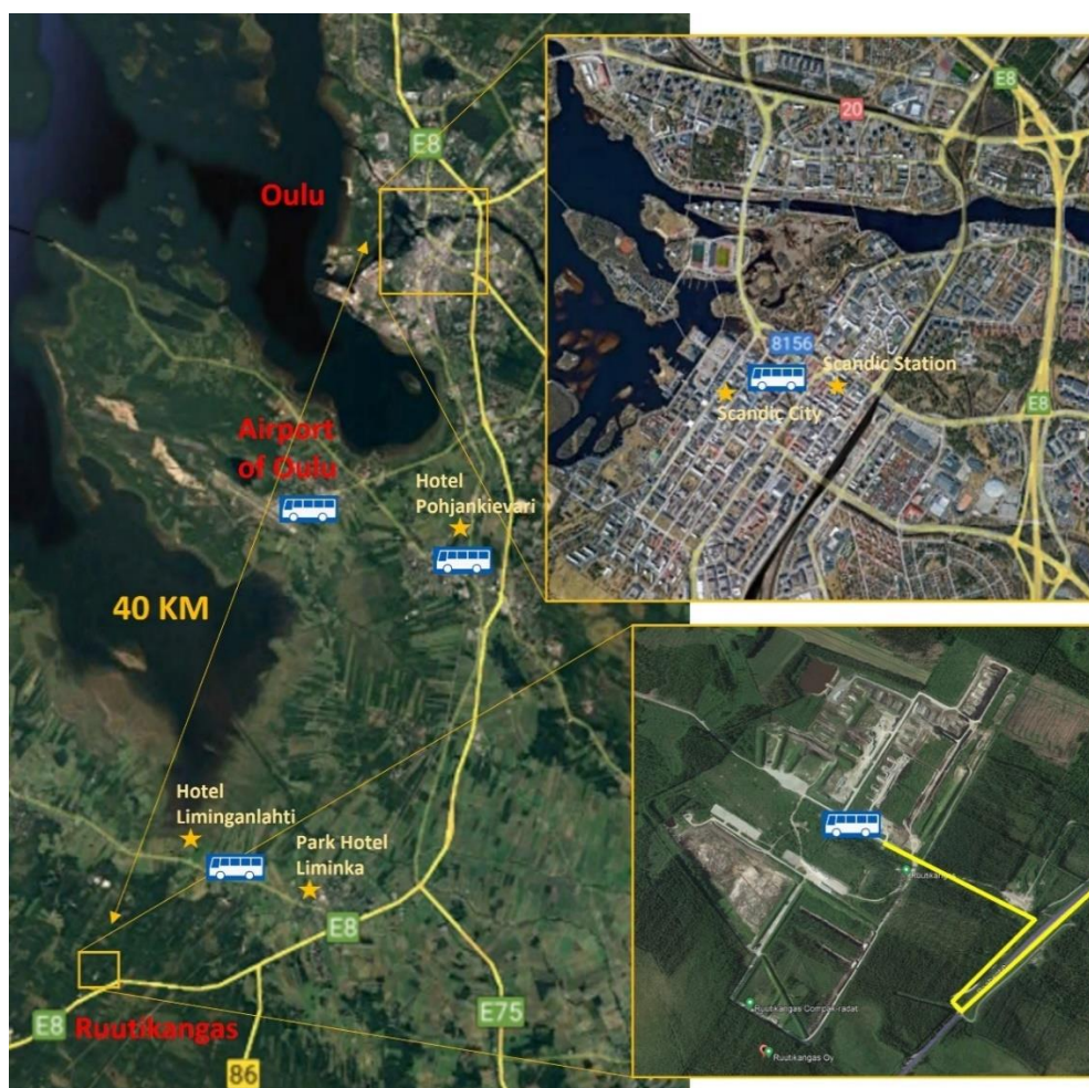
Picture 3. A map describing the range, Oulu region and official hotels reserved.

Sufficient number of hotels (3 - 4 stars) of the Oulu Region will be pre-reserved for competitors and officials. Preliminary reservations are done for 200 rooms. Majority of accommodation capacity is in the city of Oulu. The locations of hotels are presented in the next picture.